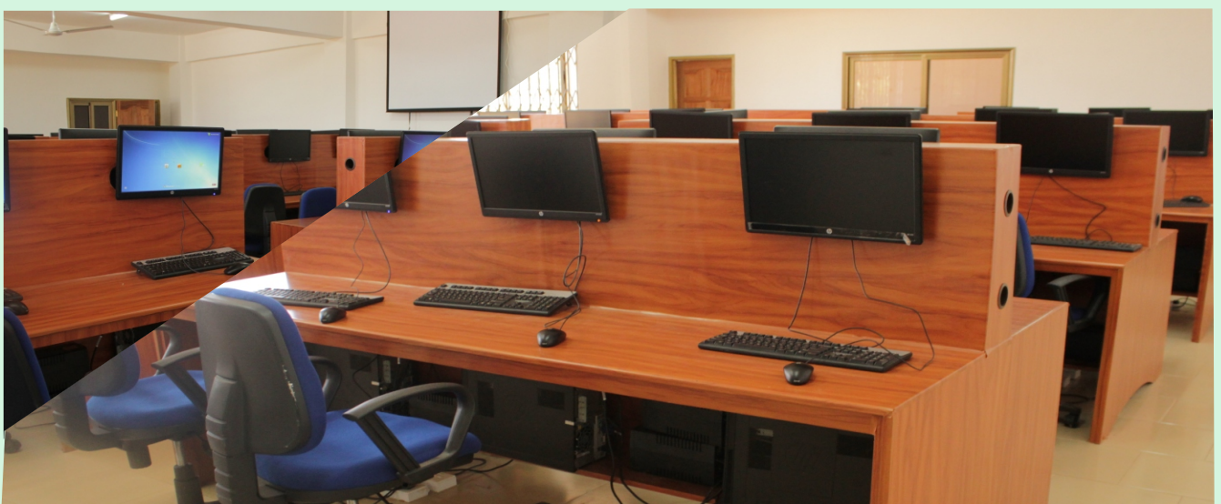
The Ultra-modern Computer Lab